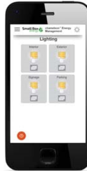
Lighting Control & Schedules