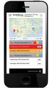
Alarm Monitoring for All Locations