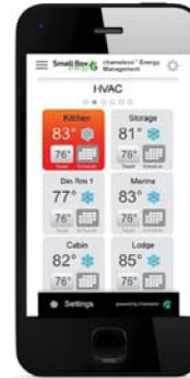
Zone Monitoring & Control